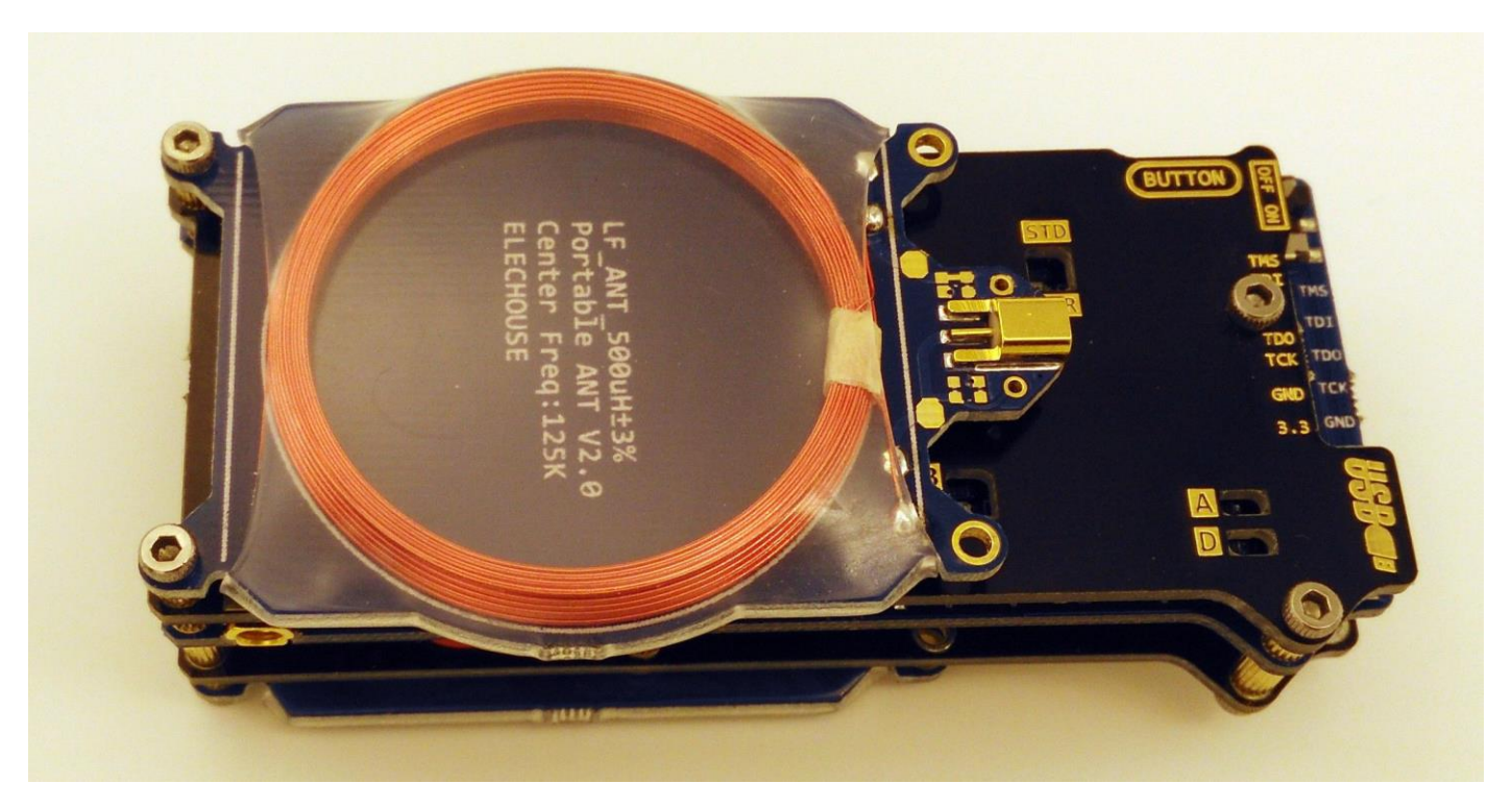
Don't forget to connect the antenna cable.