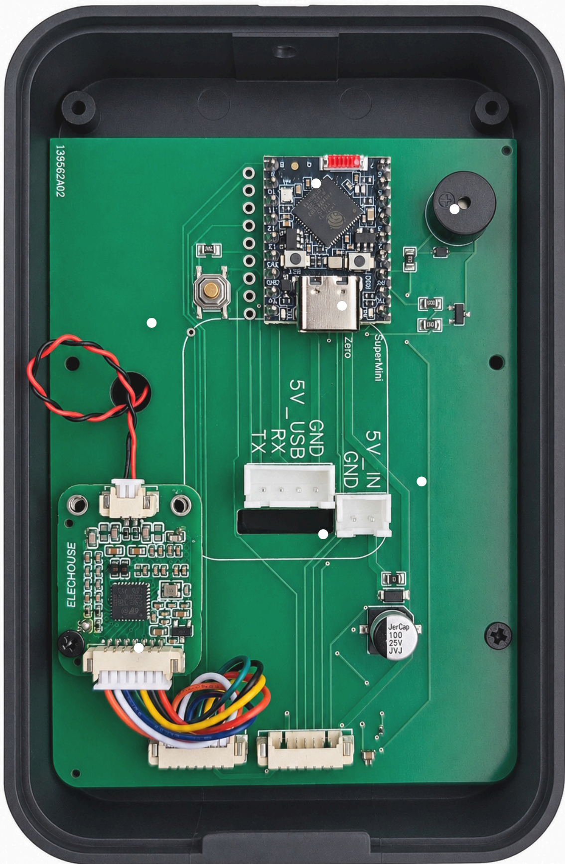
V0.1H internal layout reference. This prototype has button and buzzer populated, but no LED indicator and no UART level-shift/protection circuit.