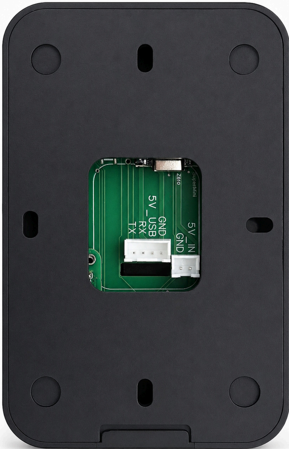
Rear mounting plate and cable window reference for installation planning.