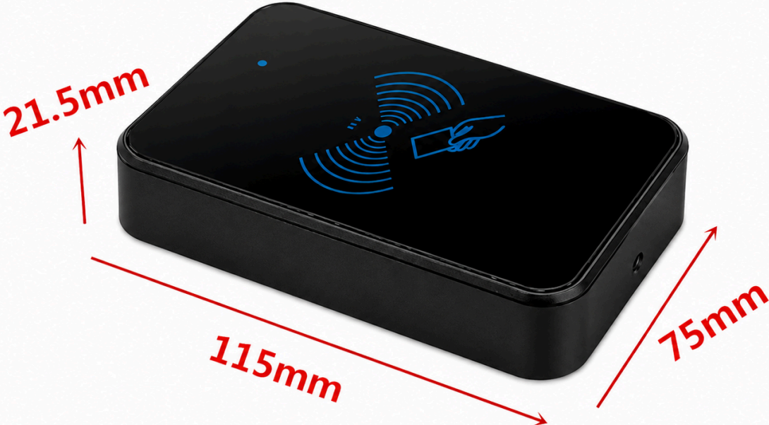
Reference enclosure dimensions: 115 mm x 75 mm x 21.5 mm.