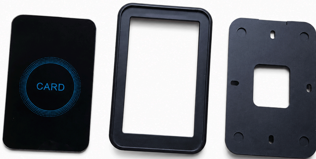
Reference enclosure parts: front panel, frame, and rear mounting plate.